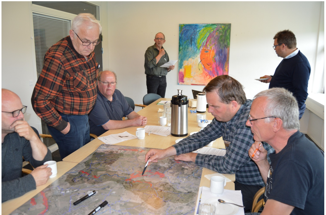
Drawing of main tiles/pipes in the local ID 15 catchment.

We are in a good progress with several farm visits in June and need now to involve Odense Municipality more in Waterdrive and the case areas.