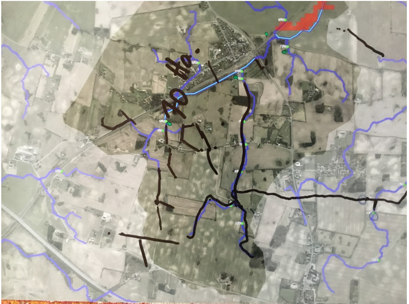
The first step – finding the main tiles/pipes (black).