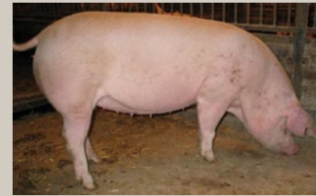
Strong and even legs